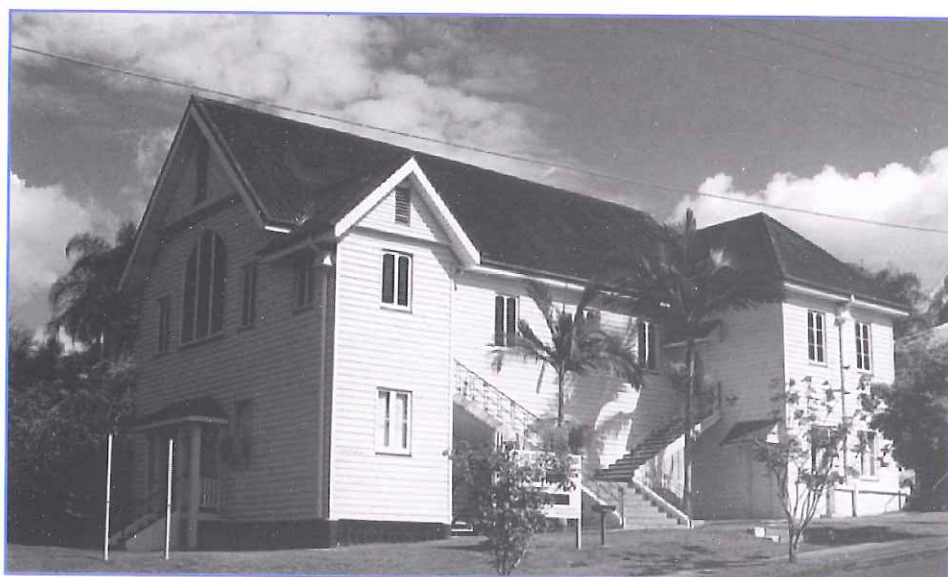
The handsome church at Munro Street, Auchenflower where the Hear and Say Centre intends establishing new headquarters.

One welcome move this year has been the decision to establish a network of interstate charities with similar philosophies to ours under the banner of the Australian Council for Oral/Deaf Children. This will facilitate a free exchange of ideas among educationalists, marketing and