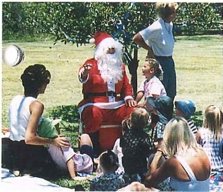
Santa was a popular and portly figure at the Centre's Christmas party.