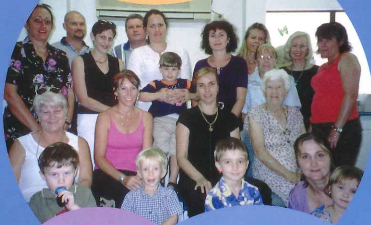
Hear and Say Centre North Queensland, Parents, Children and Staff