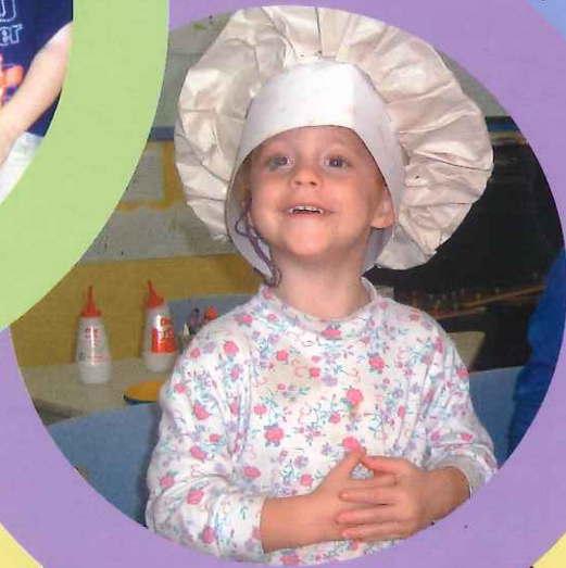
Hear and Say Centre Sunshine Coast